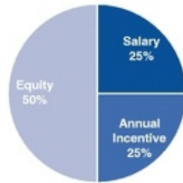
Average NEO Pay Elements