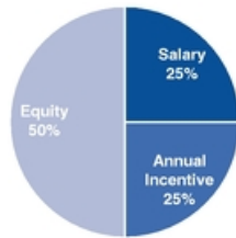
CEO Pay Elements