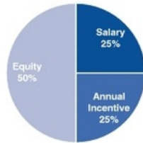
CEO Pay Elements